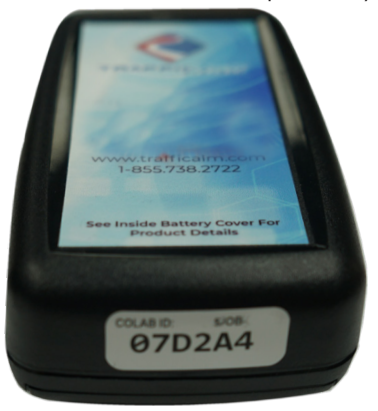
Illustration 1.1 - M75-SABRA-000T Toggle Fob with ID shown at a sharp angle

One common application this proves useful in is where flashing signs can be activated to warn drivers they need to "chain up" in snowy pass conditions. An operator can activate the system for as long as necessary and then deactivate it from the comfort of a snow plow (assuming snow plows afford some comfort to the operator)